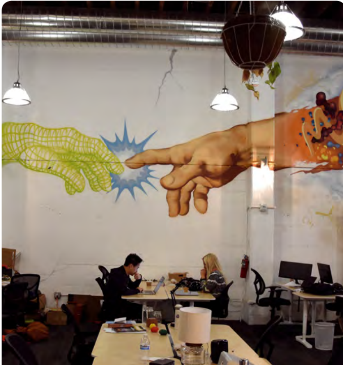
Visting IndiBio in San Francisco, the world's first synthetic biology accelerator, where biology is seen as "a technology to help solve our culture's most challenging problems."

in over 20 countries. 1 As this market gets crowded out by an overcapacity of these solutions, we are hopeful that the search for untapped markets will encourage new players to look at contributing to the challenge of getting healthy and affordable food into food deserts. These are the communities who are most in need of healthy, affordable and convenient meal options, and the technology and know-how already exists.