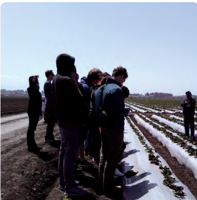
Visiting a large-scale strawberry farm to learn about the challenges and opportunities of mechanization, productivity and labor conditions