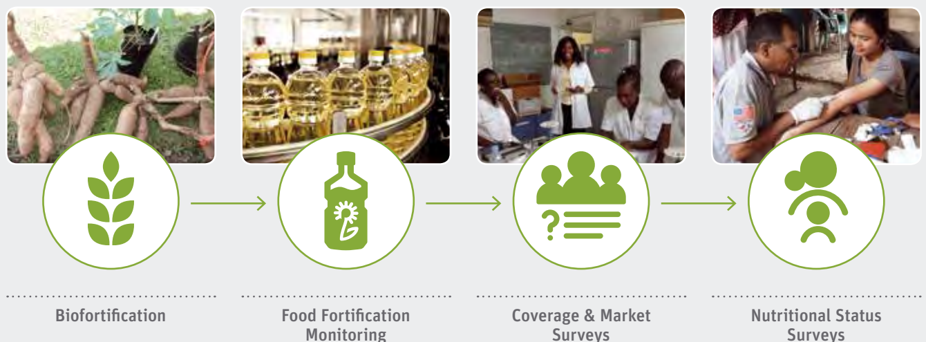
FIGURE 3: Application areas along the food value chain