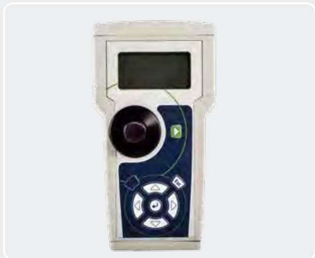
FIGURE 1: iCheck device and reagent vial